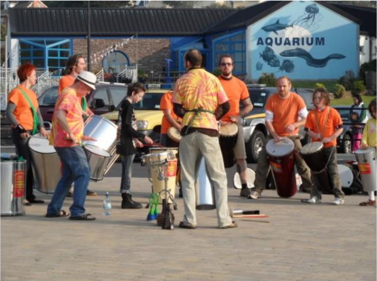
Party Starting and its only 8.30am, that's right AM!!