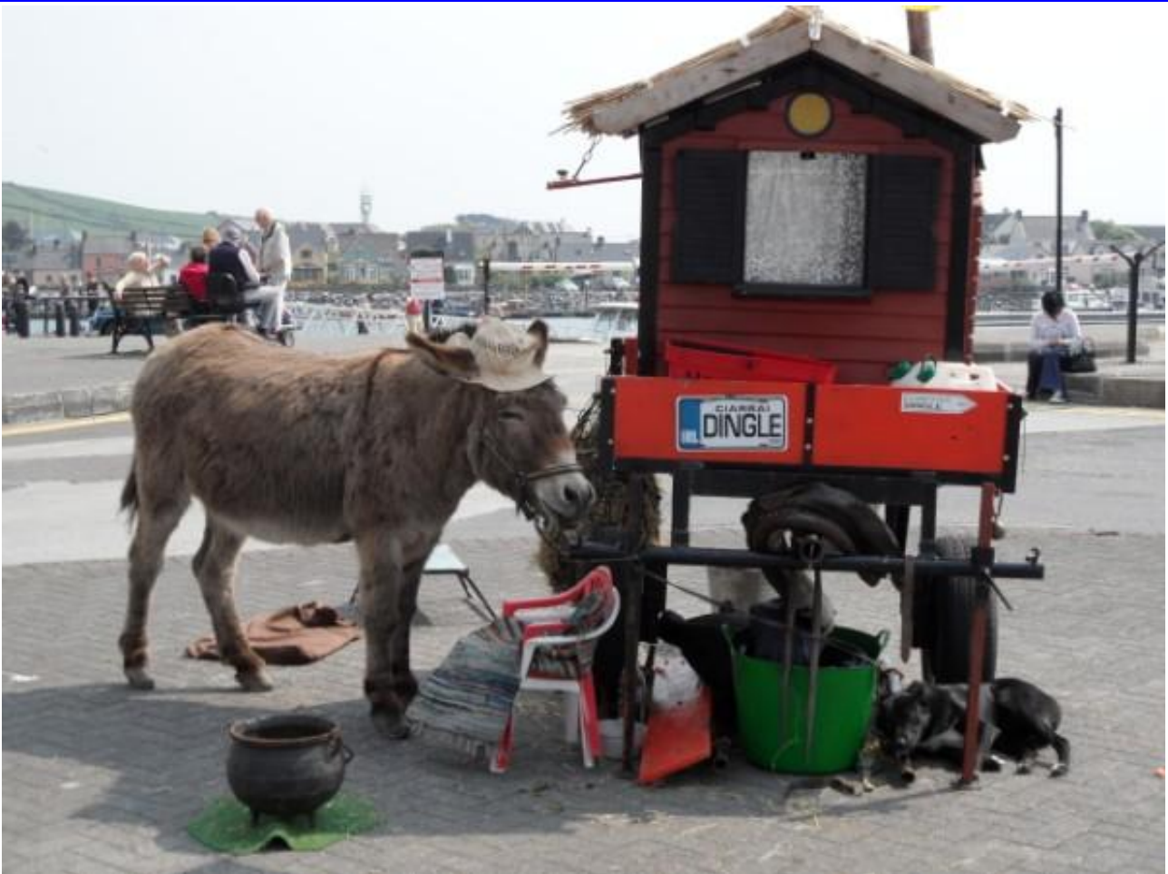
Weather So Good, Even Himself Had The Straw Hat On for Protection!!