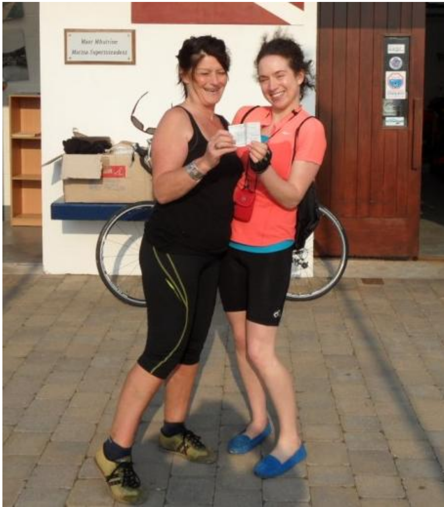
Yes, The Munster Branch Cheque, Has Got Five Figures, But Ladies there's a decimal point before the last two zero's!! Anyway Who Said Pub!! Mines a .....